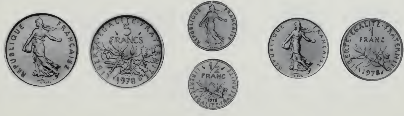
Lot No. 2713

2713 1978. Half Franc, KM P599, mintage 141 pieces; 1 Franc, KM P602, mintage 142 pieces; 5 Francs, KM P606, mintage 143 pieces. Satin finish Proofs with rich golden toning over nice surfaces. 81.4 Grams. 3 pieces.